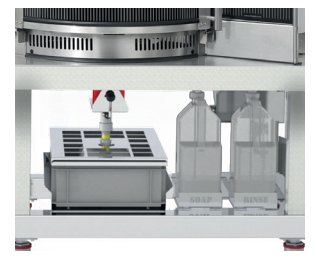
Hygienic fat collection