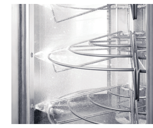
Fully automatic cleaning