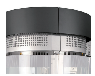
Internal condenser (optional)