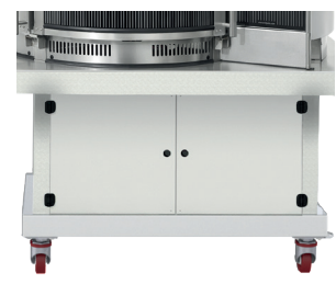
Stainless steel cladding (optional)